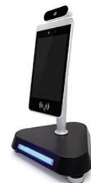
Temperature & Face Recognition Scanner