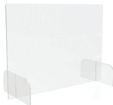
Personal Protection Barriers